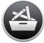
Managed Software Center

Managed Software Center (MSC) is an App that provides an easy way to install and update Apps on your 4J Apple computer. It can be found in and launched from the Applications folder: